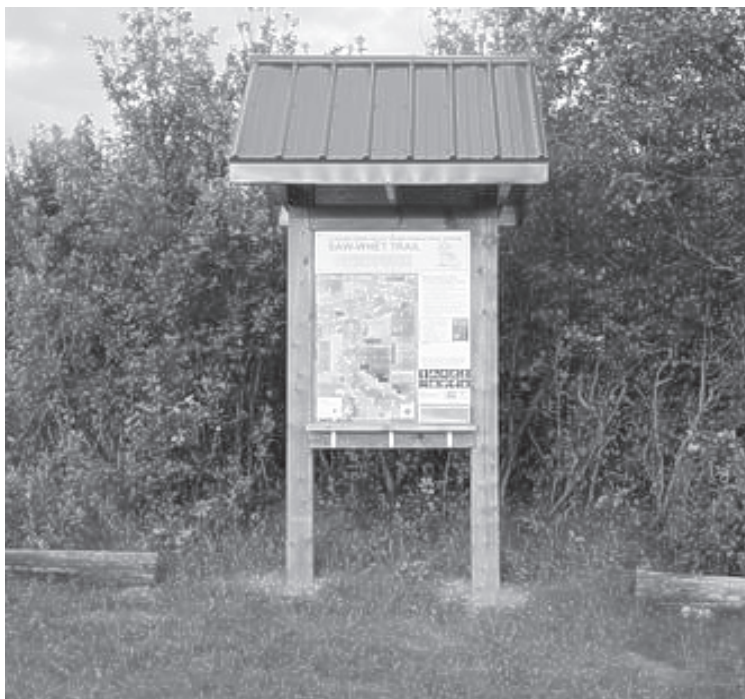
A kiosk located along the Seven Bridges Road.