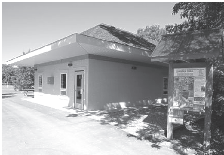
A kiosk is located beside the new River Park Centre in Lumsden.